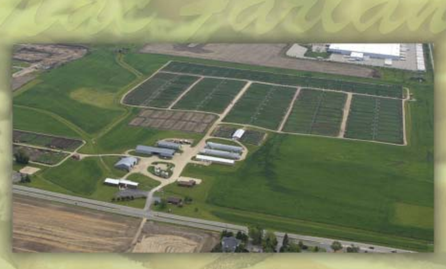
MacFarlane Pheasants Features Free Range Pens and Barns